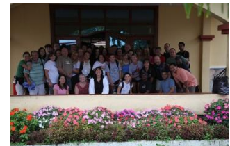
Ahuachapán, El Salvador